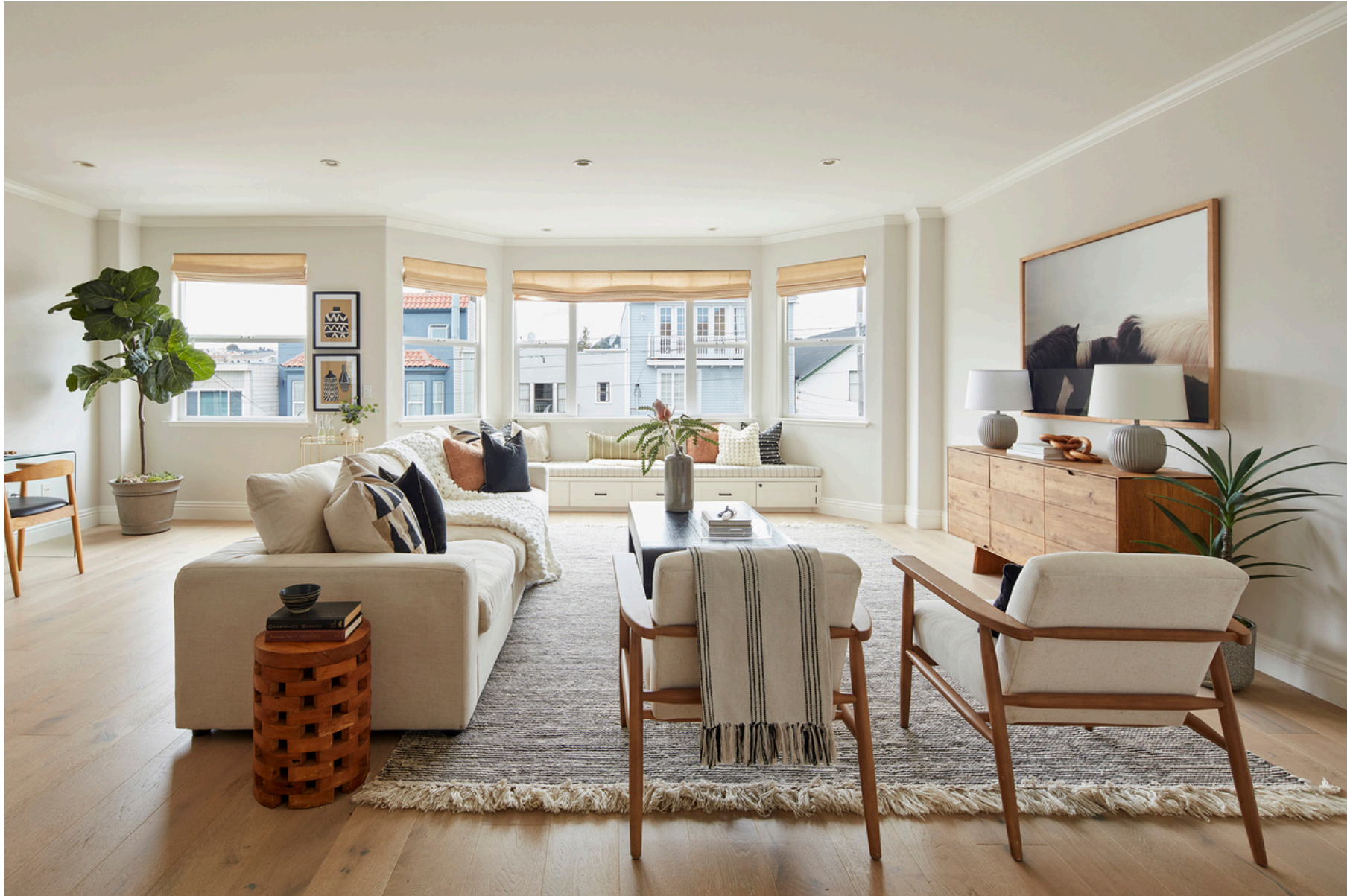
Central Richmond 366 26th Avenue, #2